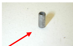
Pin Contact Sleeve Volvo Part Number: 1324909

If unit is intermittent or not working properly, check if PIN CONTACT SLEEVES are installed for proper connection.